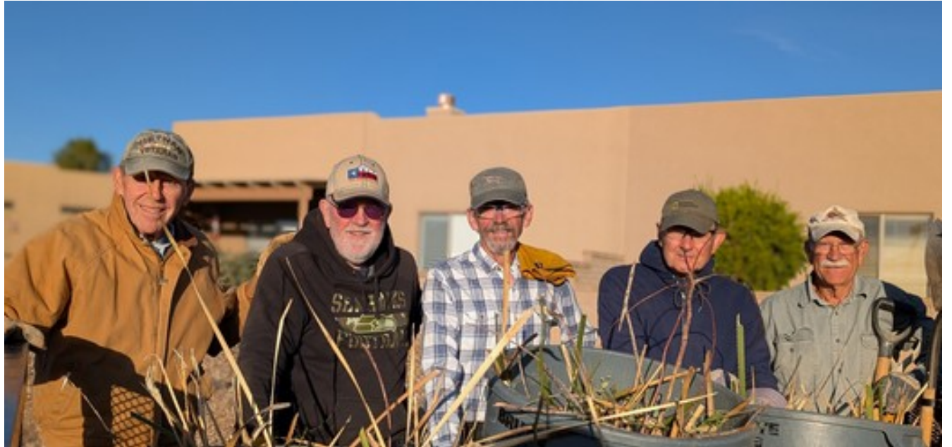
Grounds crew veterans at work on Veteran's Day, Nov 11