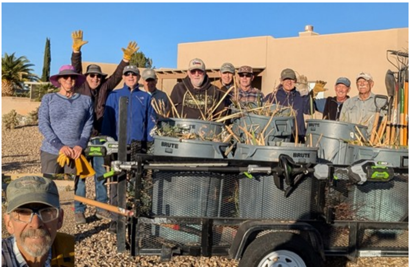
Grounds Crew on Tuesday, November 11 (Veteran's Day)