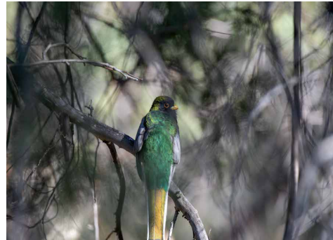
Elegant Trogon

Our Santa Rita Springs Rec Center, the big building on your right after you enter the main gate, is a multifarious asset containing many treasures, large and small: the GVR Camera Club (CC), extensive art and photo libraries, Computer Club, and Clay Studio. This summer, CHAT will explore these for the benefit of “year-arounders” and snowbirds: enjoy, anywhere you are!